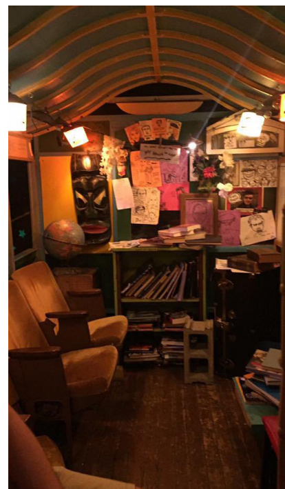
The hidden sitting area for a cafe in the City Museum, St. Louis. My order was a small cup of homemade soda and a bar of dark coffee-chocolate.

I reach into the brown paper bag, pull out my newest purchase, and flip open to the first page. I’ve never heard of this book before, but the premise sounded promising, and the cover captured me upon first glance. It features muted green and turquoise streets surrounded by a string of fairy lights with the words “Midnight at the Electric” splayed across the front in white cursive. I settle into the story with a final sip of my macchiato. With the taste of lavender on my tongue, I find myself transported twice. Once, from Macomb, Illinois to Baraboo, Wisconsin, for a family camping trip; then twice, into the world of the page.