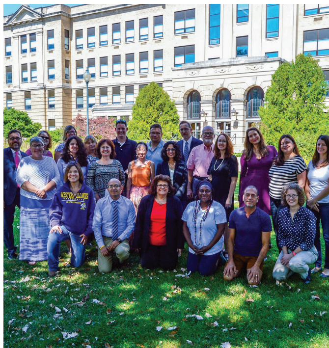
Our 2017-2018 staff pose together outside Simpkins.