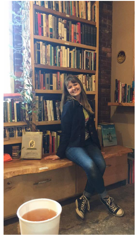
Louisville, Kentucky where my order was a cup of green tea and a scoop of vegan chocolate ice cream.

This year, I have done more traveling than ever. I’m a college student, so these trips were rustically cheap, but I still managed to find my way into weird little coffee shops and bookstores no matter where I went. In Louisville, my colleagues and I found a newly opened coffee shop/bookstore/ art