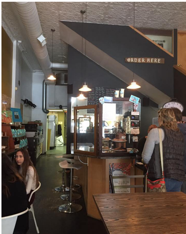
Baraboo, Wisconsin where my order was lavender-caramel decaf macchiato and an apple cider donut.

I believe that these types of moments capture an aesthetic that most English majors (and bookish people in general) can appreciate. C.S. Lewis even famously said “You can never get a cup of tea large enough or a book long enough to suit me.” Taking it a step further, I believe the combination of coffee shops, bookstores, and new places become a sort of perfect trio for the bookish person. I find myself longing to find these places as I travel, as they have become my sanctuary. This may seem obvious to some, but for me personally, this combination of the simple pleasures in life had meant nothing more than a cute Instagram picture before the year 2017.