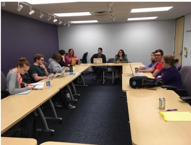
The 2016-2017 and 2017-2018 ASH Executive Boards