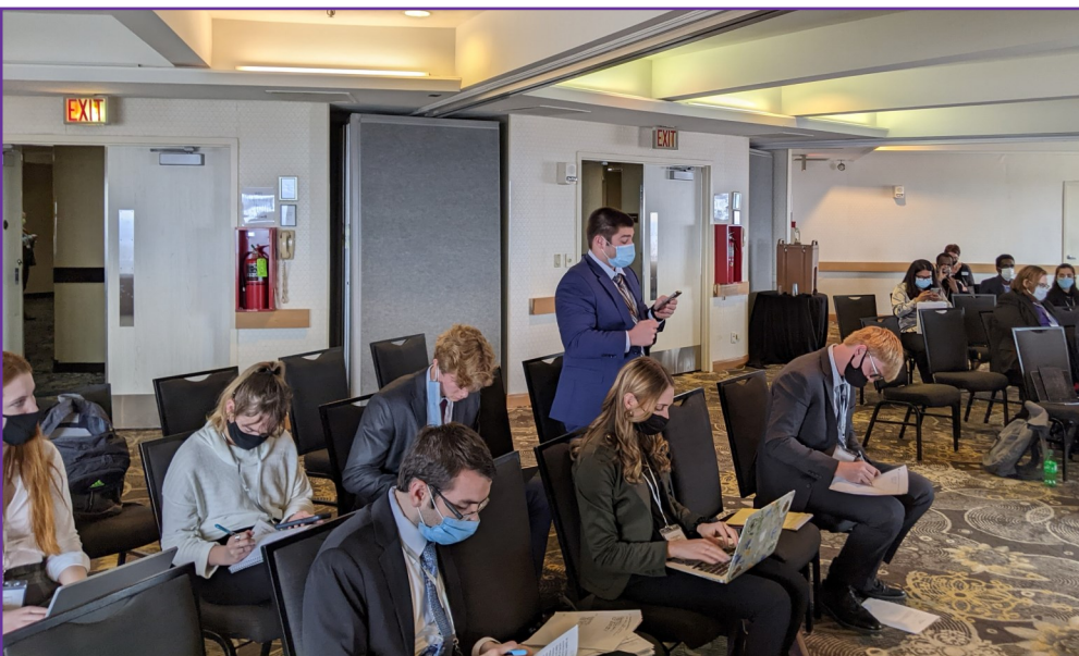
2022 MIG event held at the Wyndam in Springfield, IL