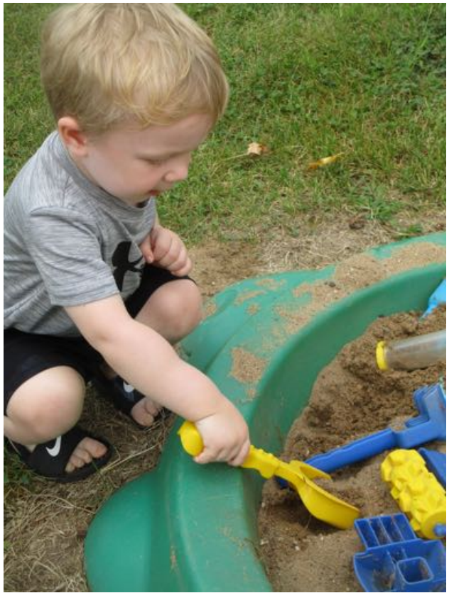
Exploring the Sand Box