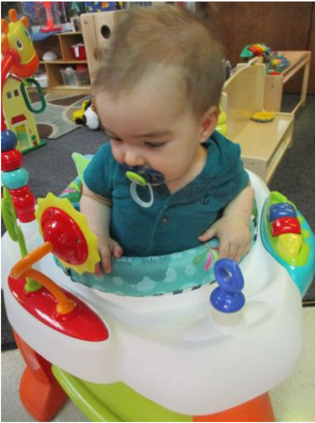
Exploring Toys and the Little Mirror!