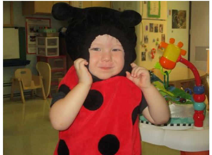
Discovering the Dress Up Costumes

Standard: Children demonstrate the ability to use creativity, inventiveness, and imagination to increase their understanding and knowledge of the world.