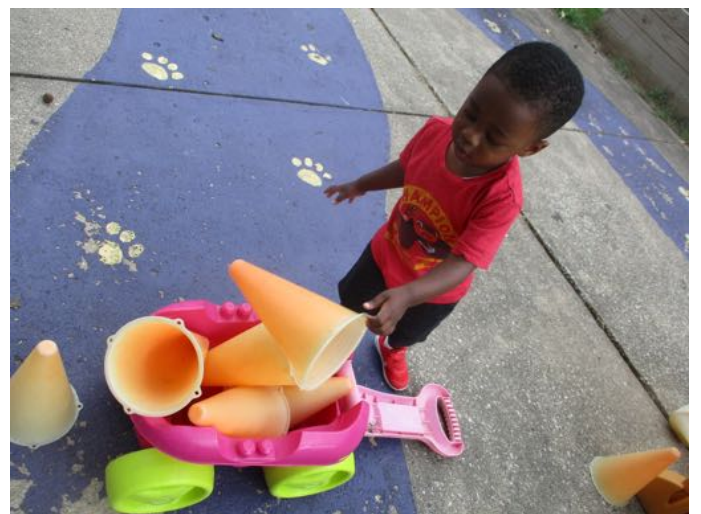
Loading the Toy Wagon!