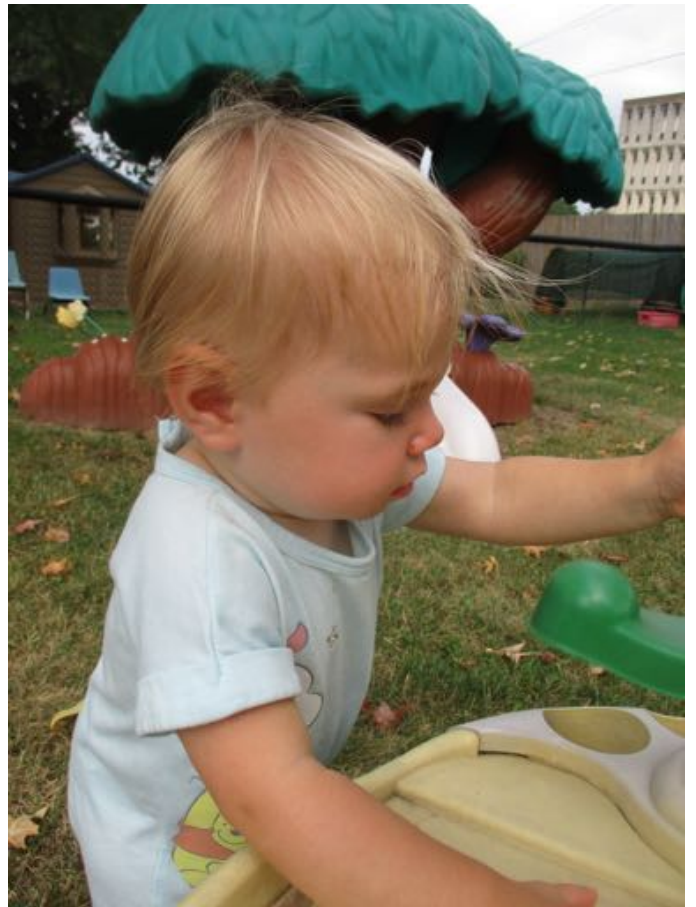
Exploring Our Outdoor Playground!