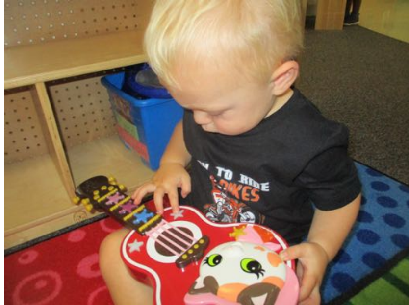
Sharing Songs and Musical Instruments!