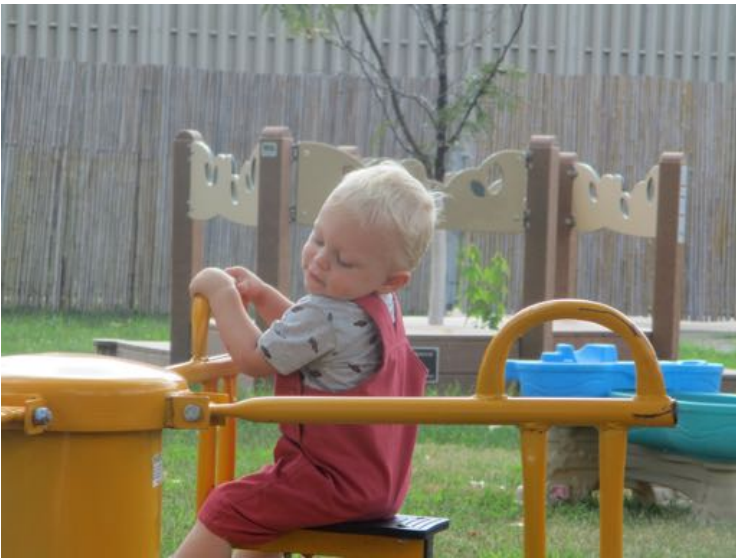
Exploring the Trike -Go- Round!