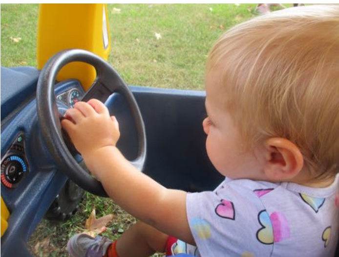
Driving the Toy Truck!

Standard: Children demonstrate the ability to use creativity, inventiveness, and imagination to increase their understanding and knowledge of the world.