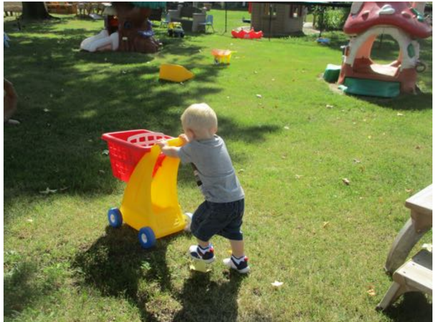
Exploring the Push and Pull Toys on our Play Ground