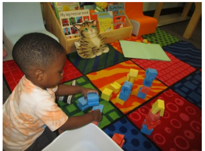
Building Towers with the Letter Blocks!