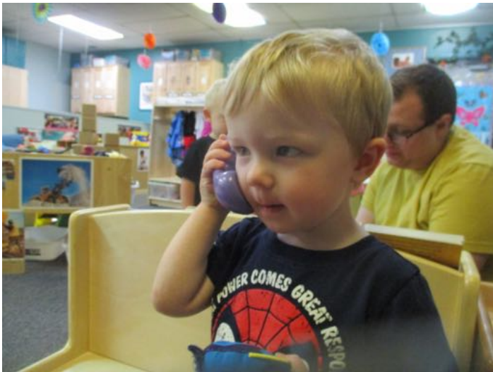
Making Important Phone Calls!