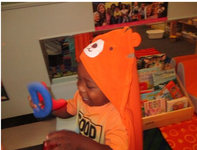
Enjoying Time with Our Friends!