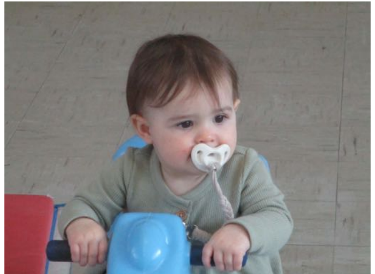
Look at Us Go!