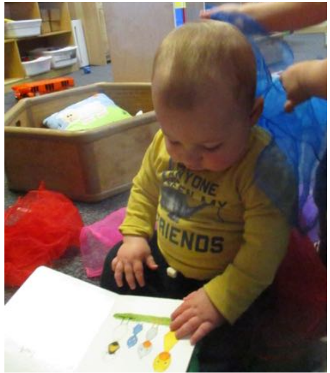
Exploring Our Books