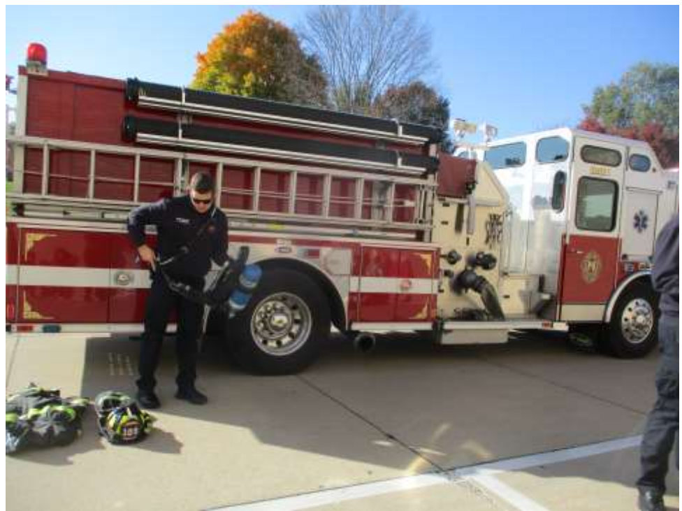
A Special Thank You to Macomb Fire Department! What an Awesome Experience for all the Students!