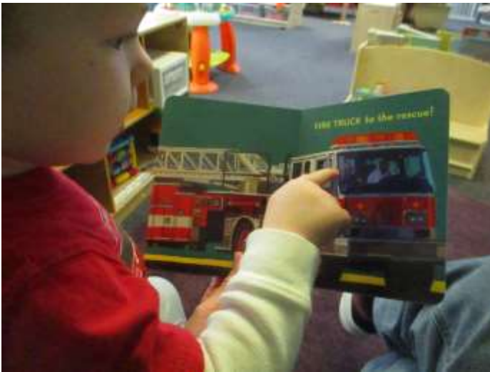
Books About Fire Fighters