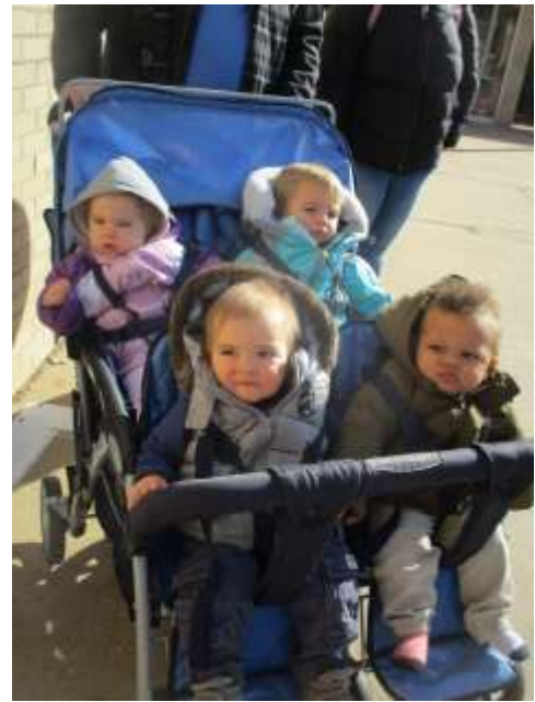
Our Stroller Ride to See the Big Fire Truck!