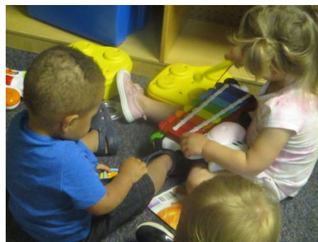
Sharing Songs with Our Friends