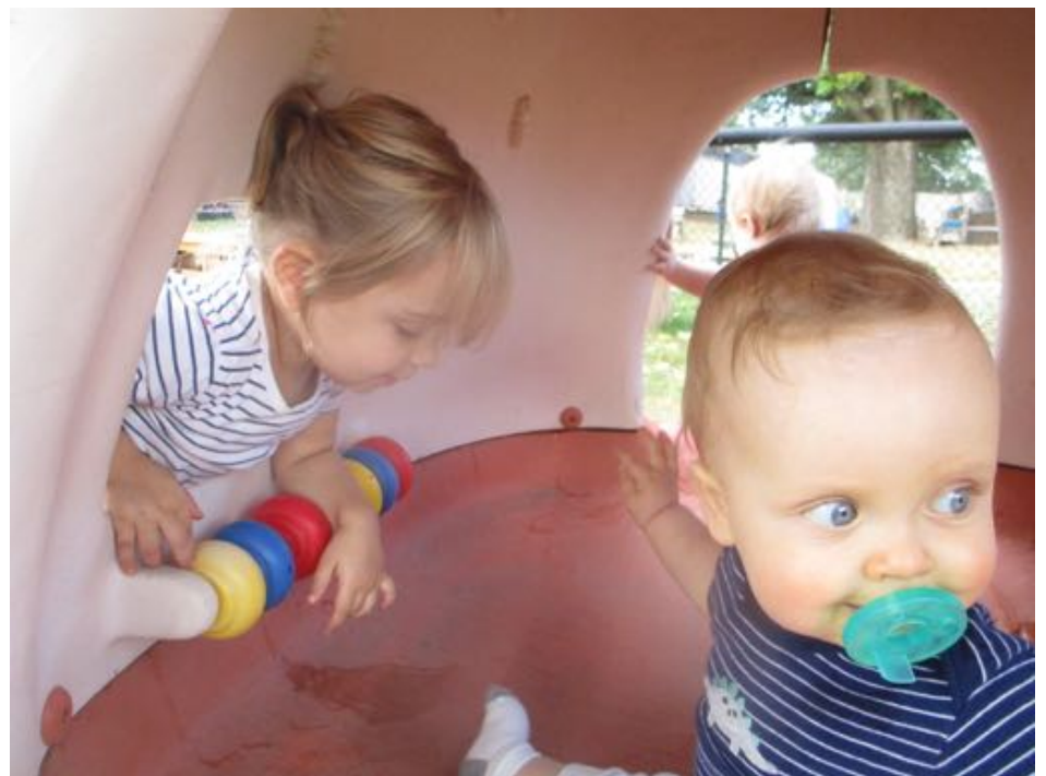
Talking with Friends in the Mushroom House