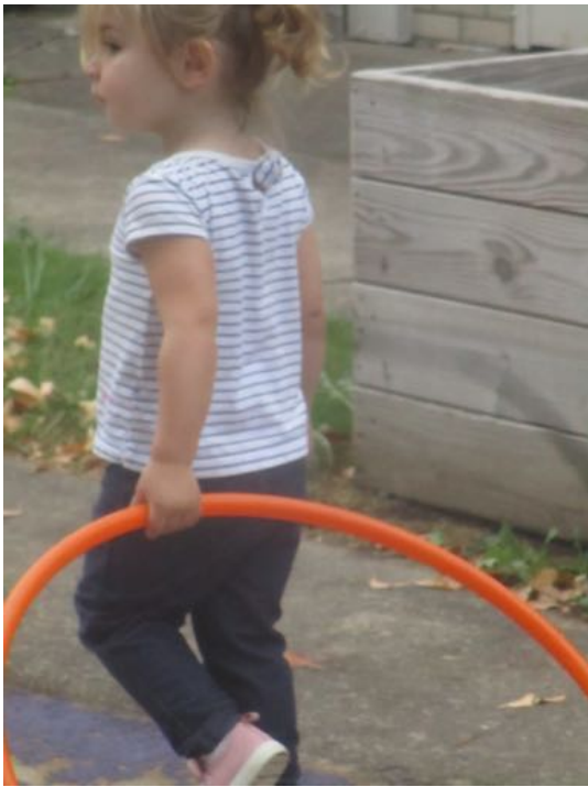
Playing with our Hula Hoops after Talking About Circles