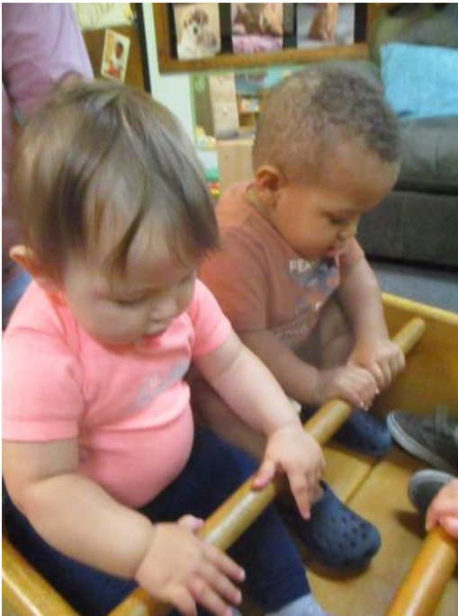
Singing Songs in our Row Boat

Standard: Children demonstrate interest in and comprehension of printed materials.