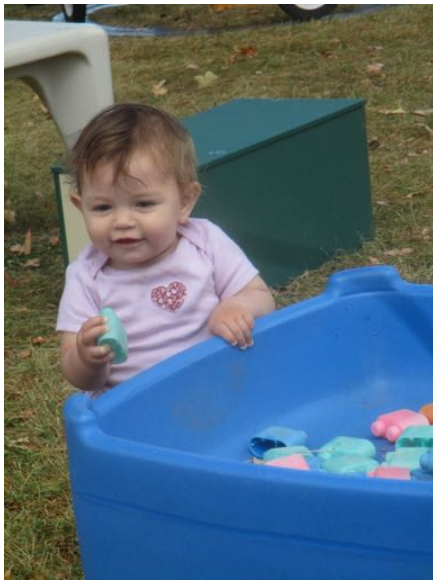
Exploring the Stacking Blocks