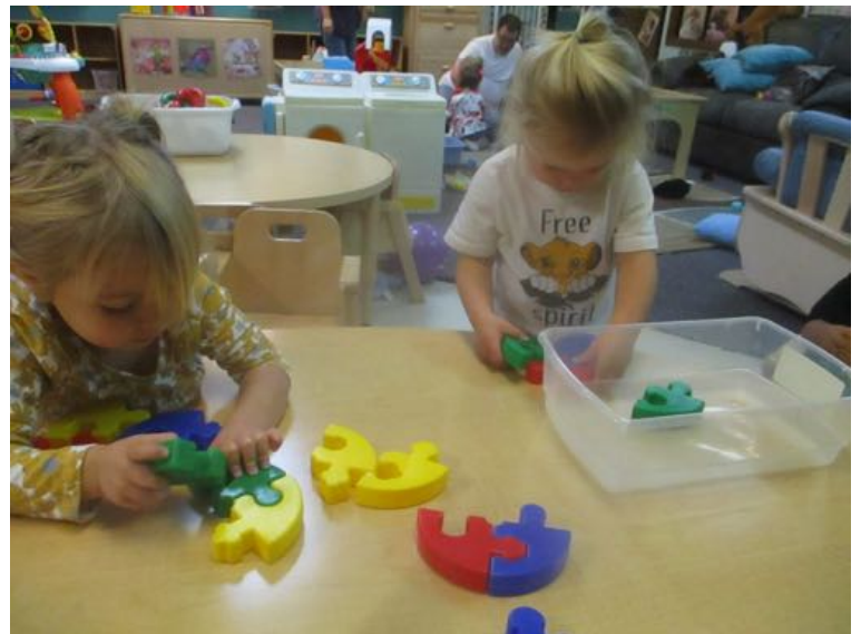
Putting Together Puzzle Pieces and Talking About our Colors