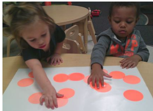
Counting the Orange Circles