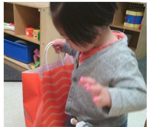
Collecting Orange Items to Place inside our Bag

Standard: Children demonstrate the ability to coordinate their small muscles in order to move and control objects.