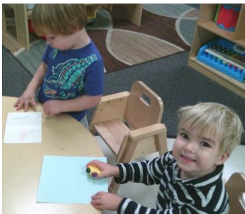
Coloring with our Crayons!