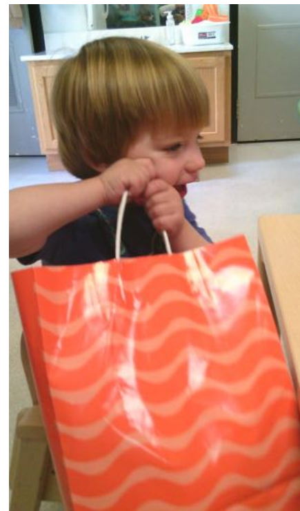
More Orange Items to Place in our Orange Bag