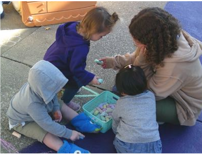
Exploring the Chalk on our Playground