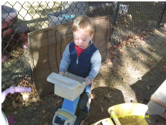
Discovering the Dump Trucks