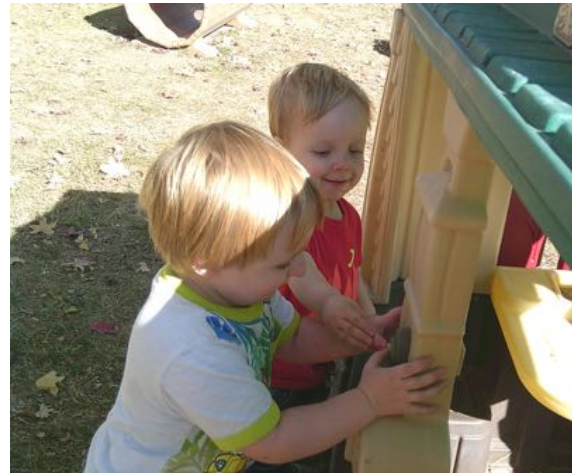
Pretending to Ring the Doorbell