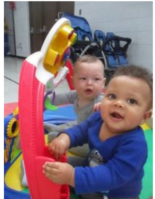
Enjoying Gym Time