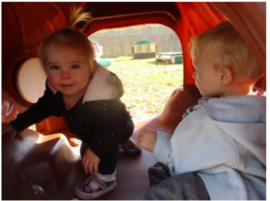
Exploring the Play House and the Tree House