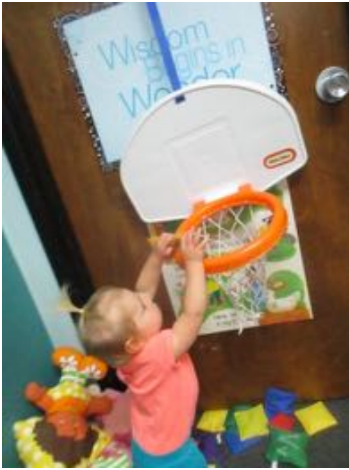
Tossing Bean Bags into the Air