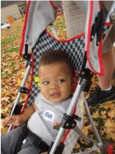
Stroller Ride Through the Leaves