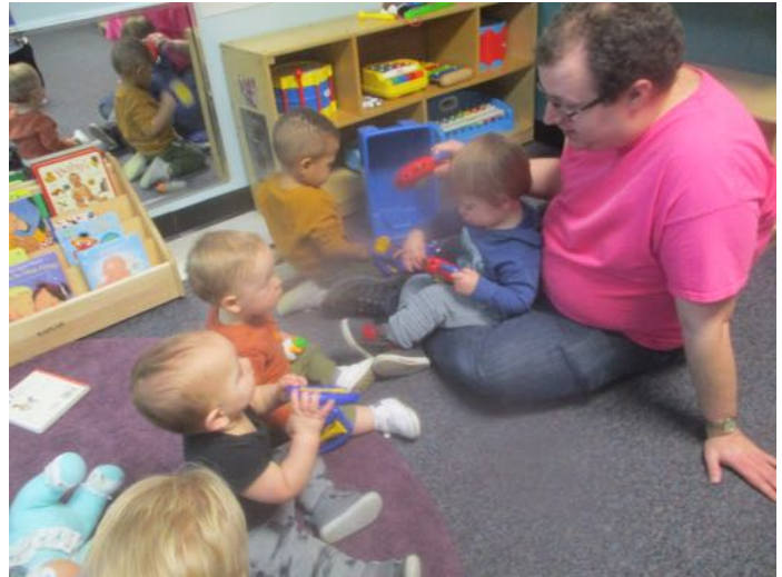
Singing Songs with Our Friends