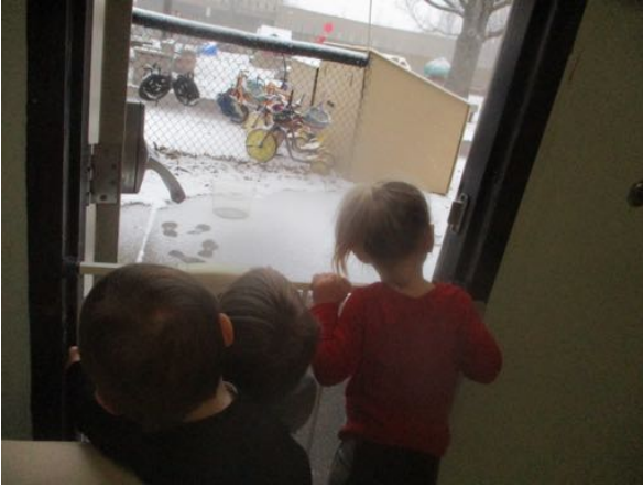
Placing an Empty Container Outside to Capture the Snowflakes