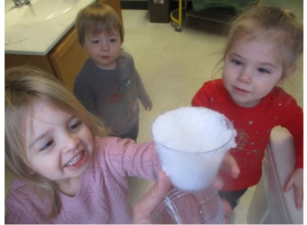
Collecting a Cup Full of Snow