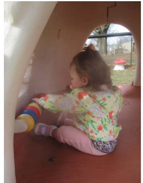
Playing Outside and Enjoying the Spring Weather