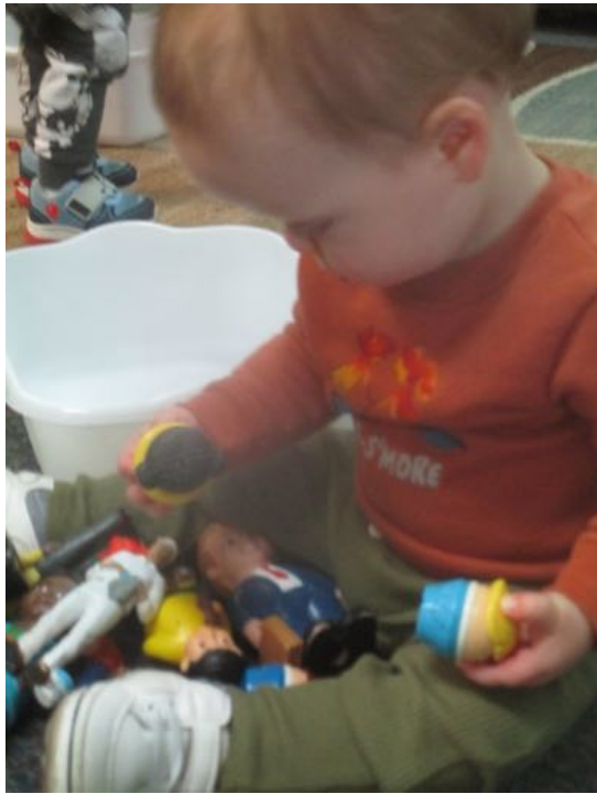
Exploring the Dollhouse People