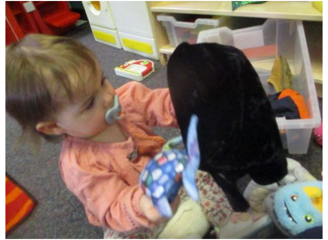
Exploring the Blocks, Puppets and the Dress Up Clothes