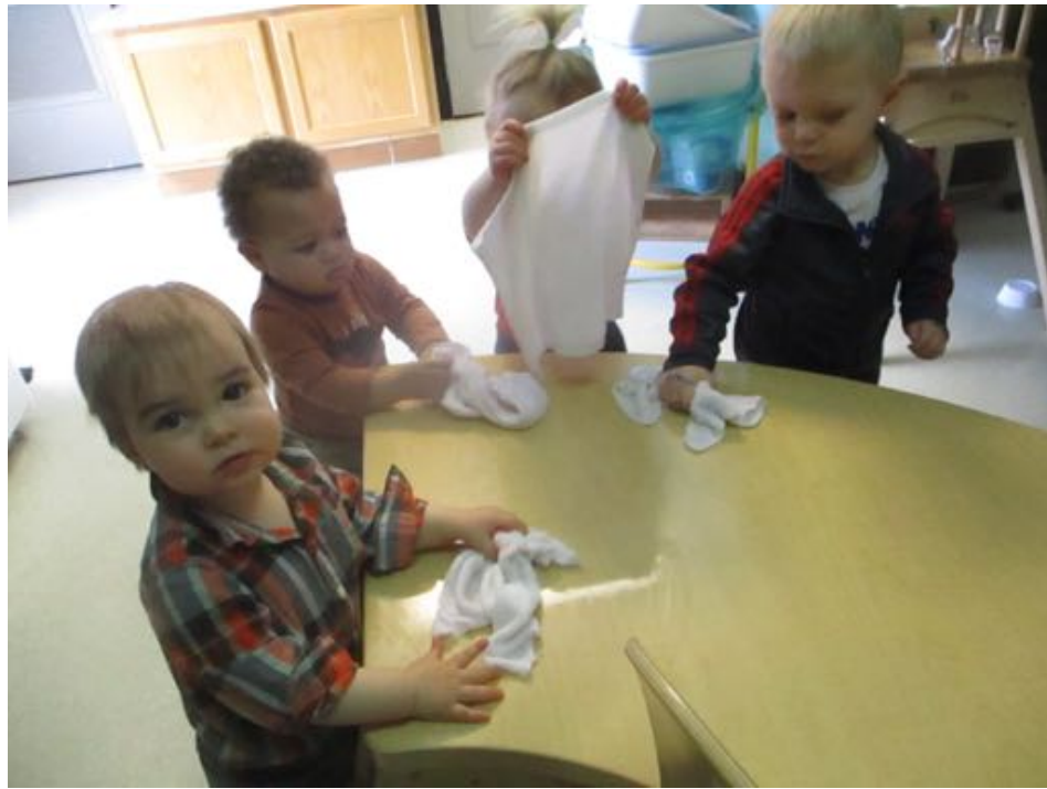
Working as a Team to Clean the Table