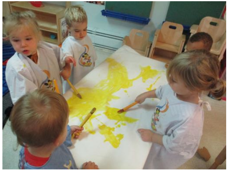
Exploring the color yellow with our paint brushes