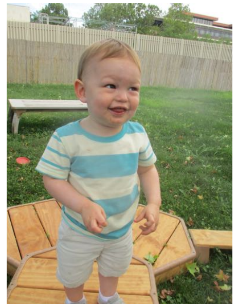
Exploring the classroom and our outdoor playground