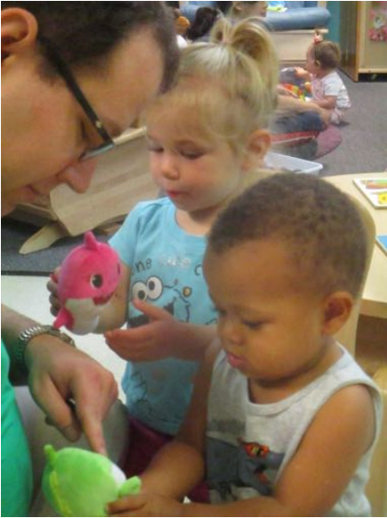
Singing the “Baby Shark” song