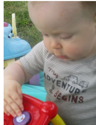
Exploring Our Toys