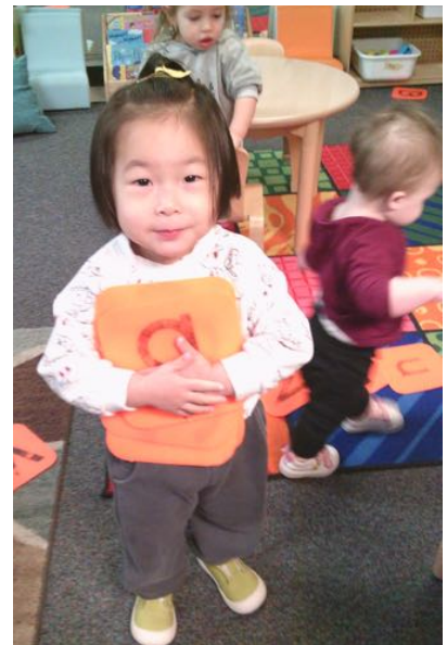
Searching for the Alphabet Letters in our Room