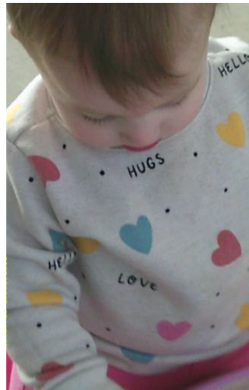
Exploring the Toys in the Gym