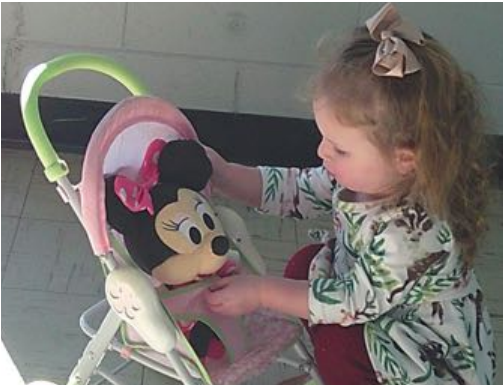
Taking Care of our Stuffed Animal Friends