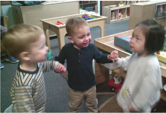
Dancing at Music Time