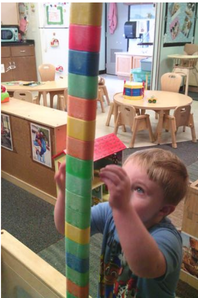
Building with our Blocks