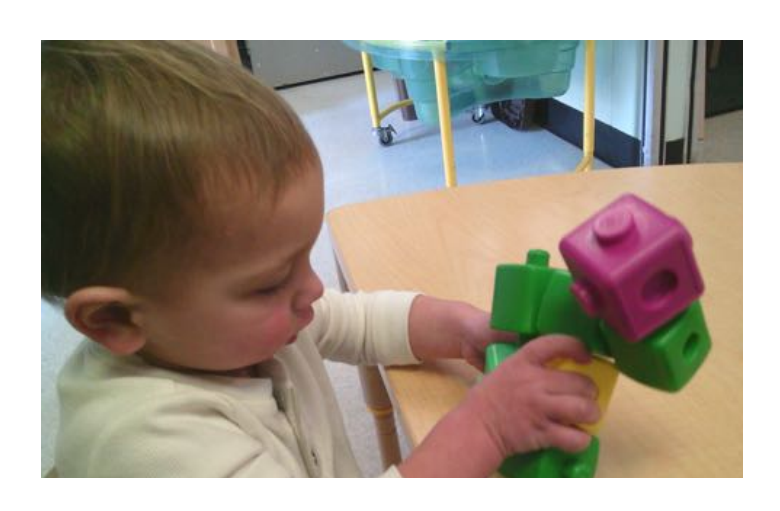
Building with the locking blocks