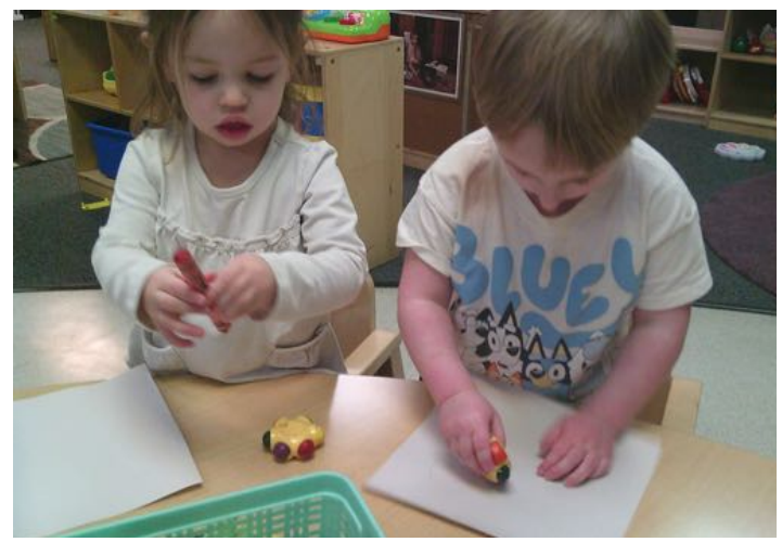
Creating Pictures with our Crayons