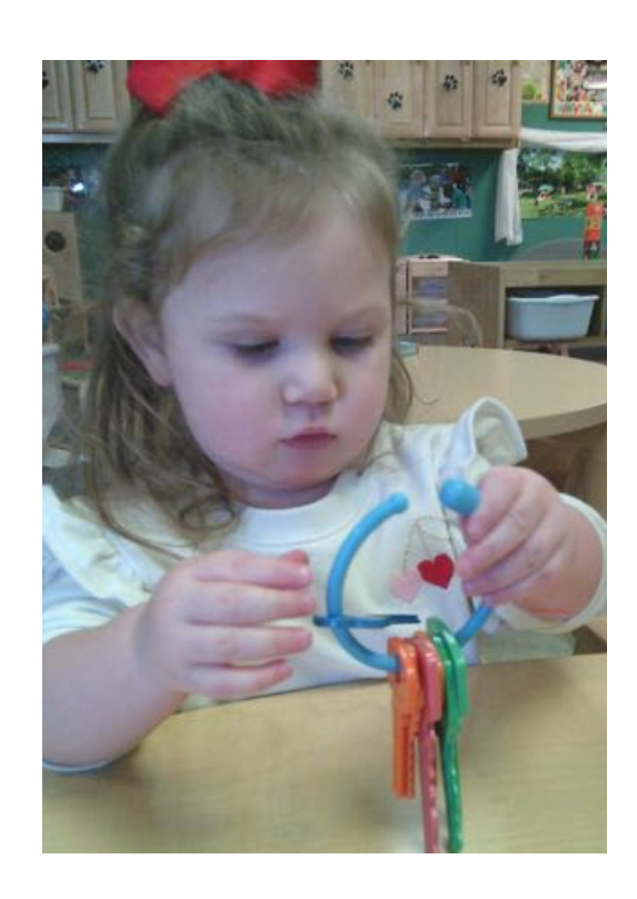
Threading the Plastic Keys and Discussing our Favorite Color

Standard: Children demonstrate the ability to use knowledge, previous experiences, and trial and error to make sense of and impact their world.