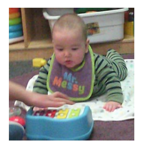
Exploring the Toy Piano and Enjoying Tummy Time