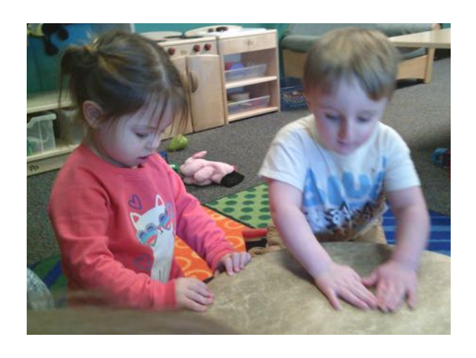
Exploring the Gathering Drum