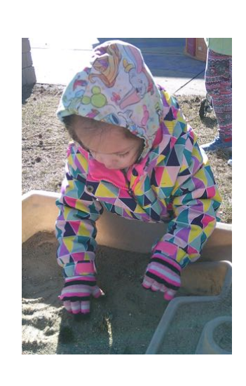
Enjoying the Sunshine during Playtime on our Playground